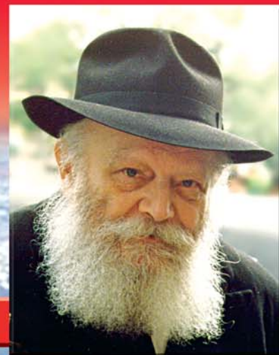
The Rebbe King Moshiach שליט"א

Torah portion: Eikev, 17th of Menachem-Av 5762 (07/26/02)